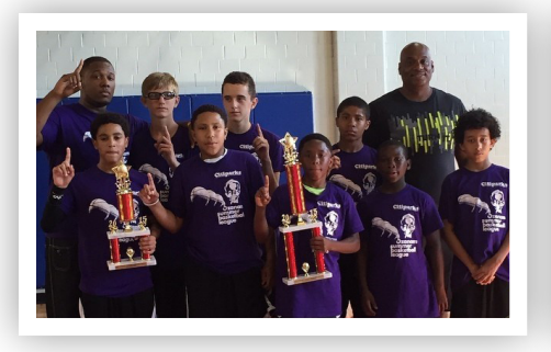
212 Degrees Boys 12 & Under Summer League Champions.