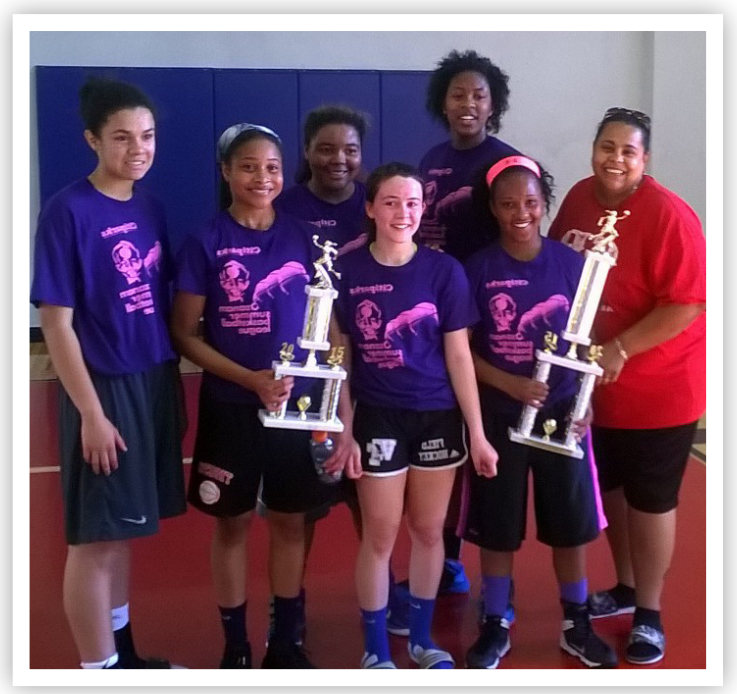
18 & Under Girls Champions