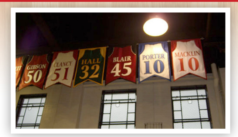
AMMON RECREATION CENTER