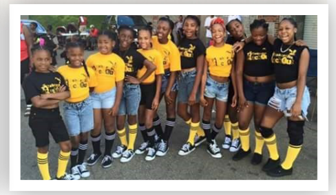
Pittsburgh Blackout Dance Team