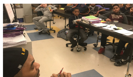
Arlington All Stars in STEM Science lab