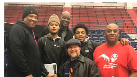
Ozanam Family Affair