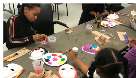
Eye for painting. Future artist at work.