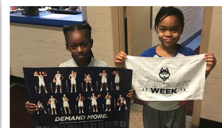
Ozanam girls celebrating National Girls and Women in Sport Day