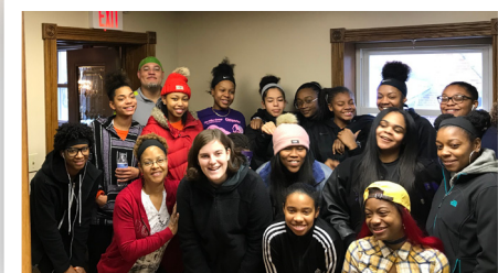
Pittsburgh Obama Girl's Basketball Team all smiles after road game